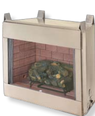
O36NRRA includes "stacked" style, warm red textured brick.