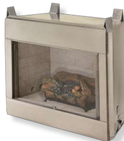
O42PRA operates on propane gas and features textured brick refractory in natural white.